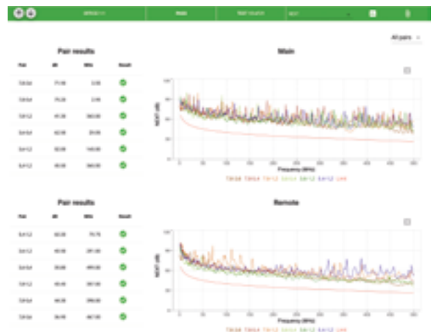
TREND AnyWARE Cloud Test Result screen